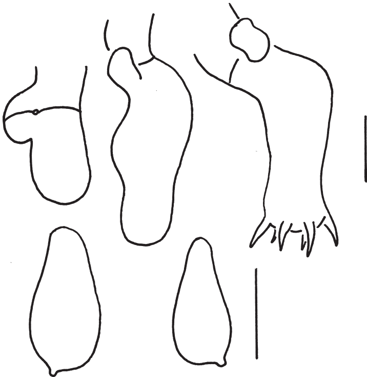
FIG. 2. Botryobasidium sassofratinoense (coll. A. Bernicchia 7594) Basidia and basidiospores. Bar=10 \mu m above, 5 \mu m below

subhymenium, slightly thick-walled in subiculum, 10–12(–15) \mu m wide and slightly yellowish near to the substrate. CYSTIDIA tubular, not frequent, basally clamped, hyaline, smooth, thin-walled, apically obtuse, 28–45(–55) \times 5–7 \mu m, without additional septa (Figure 1). BASIDIA arranged in botryose clusters, suburniform to subcylindrical, slightly constricted, smooth, thin-walled, basally clamped, (13–)18–25 \times 6–8.5 \mu m, usually with 6 slender sterigmata up to 2.5–3.5(–4) \mu m long (Figure 2). BASIDIOSPORES navicular (Figure 2), hyaline, smooth, thin-walled, mostly glued together in groups of four, IKI–, (6–)7–8.5 \times (3–)3.5–4.5 \mu m, with apiculus bent towards ventral side, L^* = 7.7 , W^* = 3.9 , Q^* = 1.97 . Chlamydospores and anamorph not found.